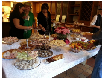
members at our food table