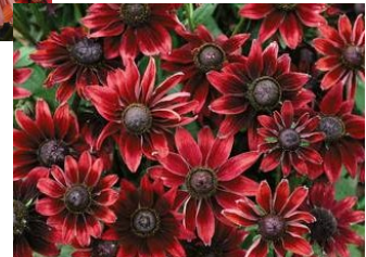
Rudbeckia "Cherry Brandy"