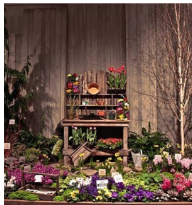
“First Breath of Spring,” the 2010 show-stopping blooming display by the Flower Growers of Puget Sound--as seen on the blog.