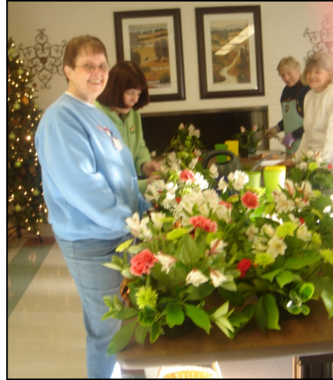
Ladies at work...