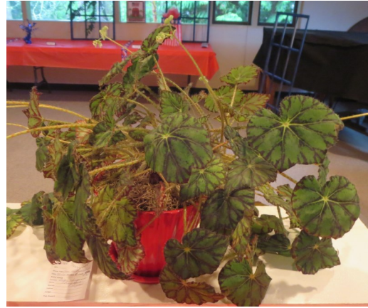
Gale Baullinger's potted, blooming begonia, a prize-winning container plant