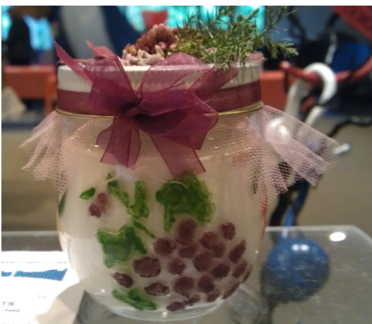
Rita Hansen's prize-winning jelly jar, Special Exhibit: Creative Freedom, "The Sweet Life"