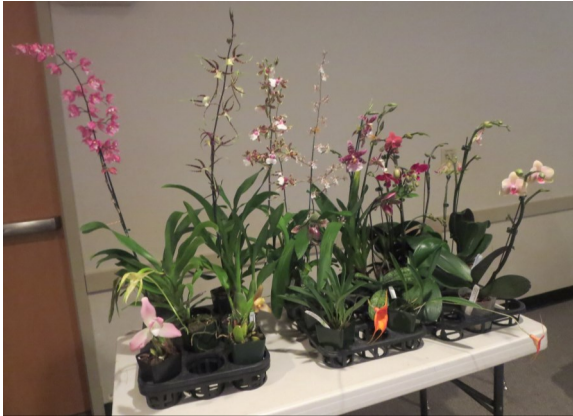
Joe Grienuer's Orchids, shown and discussed in the first program