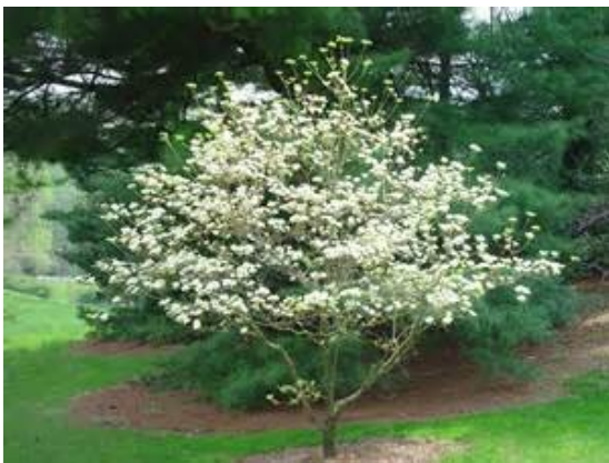
Image of white 'Cornus Florida'