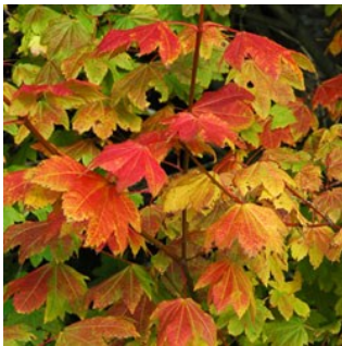
Vine Maple in fall

October Meeting: BBG Tour and Native Plant Program