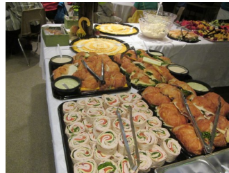
Some of the luncheon crew and the of the food provided.