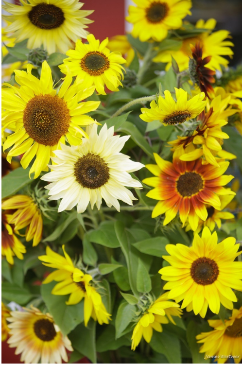
Joanne Westveer's sunflowers