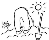
Illustration by Josef Capek, from The Gardener's Year .

This month: Wonderful Plants for Winter Color and Interest